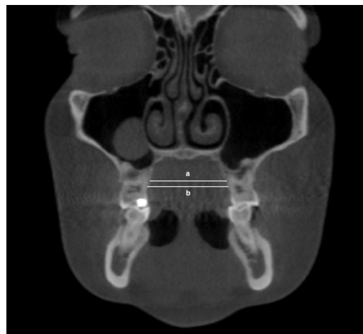
Figure 2. Maxillary inter-lingual bone widths at the level of furcation (a) and alveolar crest (b).