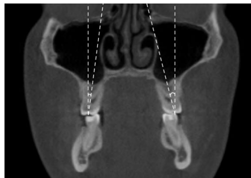
Figure 5. Inclination of maxillary first molars.

The following first molar inclination measurements were made as shown in Figures 5 and 6. The long axis of the tooth was defined as a line connecting the midpoint of the buccal and lingual cusp tips and the midpoint of the buccolingual width at the cervical base close to the furcation of the anatomic crown. The angle was measured from the long axis of each maxillary and mandibular first molar to a vertical reference line that was perpendicular to the horizontal reference line. If the crown was lingual to the roots, the inclination would be negative (−) and if the crown was buccal to the roots, the inclination would be positive (+).