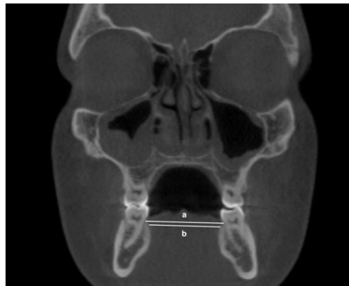
Figure 4. Mandibular inter-lingual bond widths at the level of alveolar crest (a) and furcation (b).