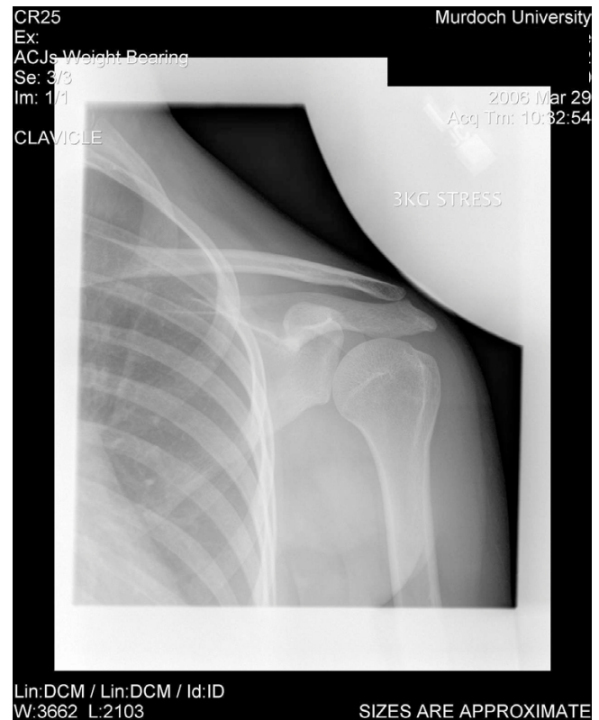
Figure 3 see attached jpeg file named "XRay 3".

of optimum motor patterns and improving muscular balance of the shoulder girdle.