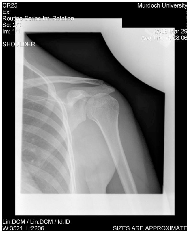
Figure 2 see attached jpeg file named "XRay 2".