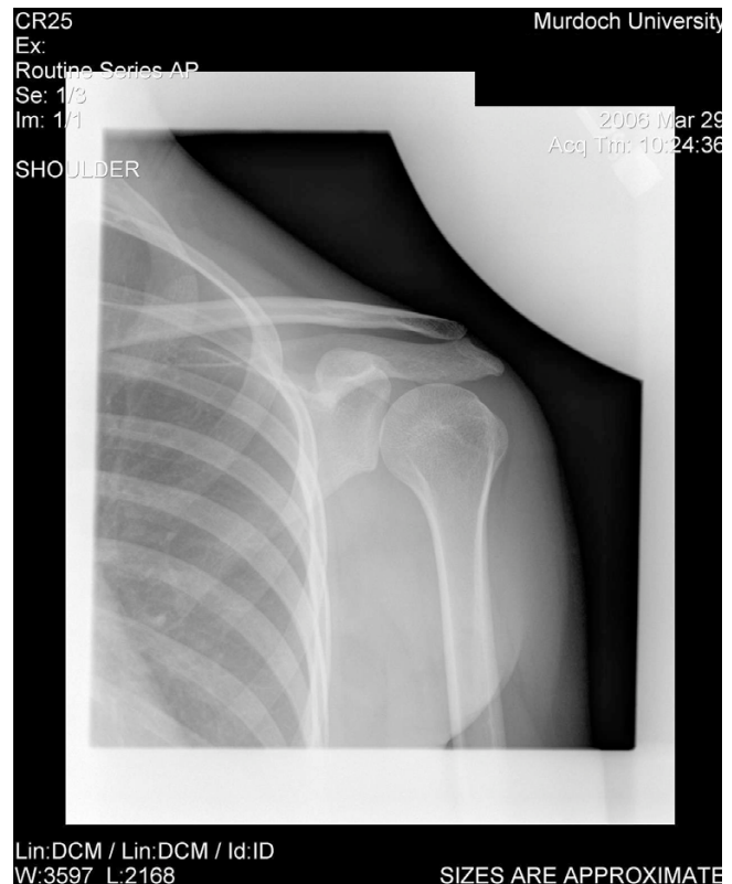
Figure 1 see attached jpeg file named "XRray 1".

Radiological investigation was ordered to rule out an anatomical aetiology (such as shoulder joint dysplasia) and confirm or deny an aberrant motor pattern as the sole cause of dysfunction. This consisted of plain film radiography and video fluoroscopy. A left shoulder series consisting of AP internal rotation, AP external rotation, and AP weighted (3 kg) neutral views (all taken in Grashey position [20]) revealed no bony dysplasia (Figures 1, 2, 3). Video fluoroscopy consisting of AP and axial projections confirmed the suspicion that the humerus subluxated inferiorly at the glenohumeral joint as it moved through the abduction arc. The axial projection showed a significant posterior component to this subluxation. A follow-up projection AP projection with co-contraction of the shoulder showed that these newly combined motor patterns kept the glenohumeral joint stable, making the arc of motion smoother, and reducing the dynamic subluxation. When viewing the following videos note the significant dysrhythmia for 4 repetitions followed by a smoother rhythm from the patient's conscious facilitation of co-contraction (see Additional file 3).