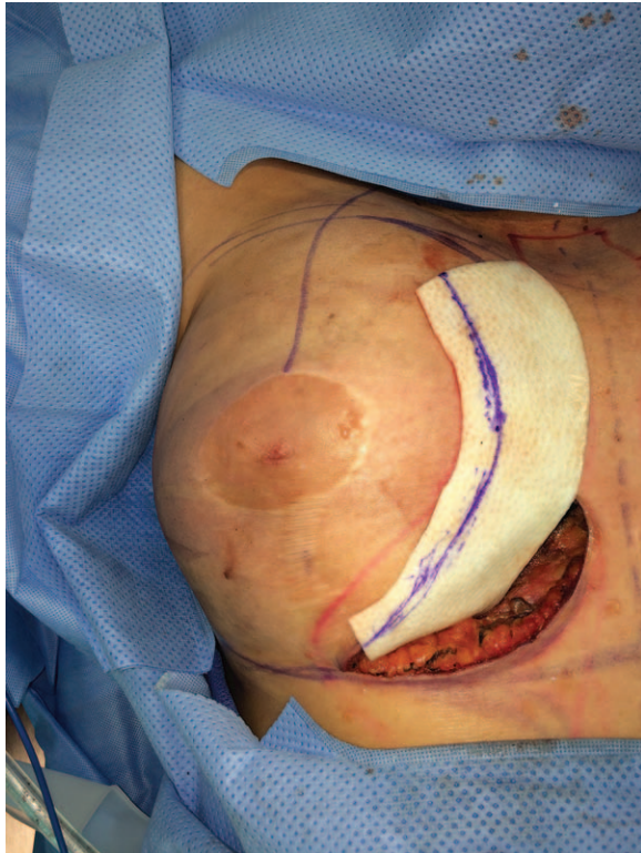
Fig. 3. Fixation of the Strattice.

space); (4) the intermammary web space was closed using 3 vertical columns of a continuous 2-0 Maxon suture (Covidien Corp, Minneapolis, Minn.): deep dermal tissue of the presternal skin flaps was secured onto the sternal periosteum (midline column) and pectoralis fascia (2 lateral columns). Preoperative marking with the needle dipped in methylene blue assumed particular importance by ensuring that each fixation stitch of this column hitched the dermis to a more superior position on the sternum, thus obliterating the entire intermammary web down-up. In addition, Tisseel (fibrin sealant; Baxter Healthcare, Deerfield, Ill.) was sprayed onto the presternal space to further enhance the adherence of this skin to the underlying sternum; (5) the medial border of the footprint (again corresponding to methylene blue needle marks) was secured down to the medial edge of the Strattice to redefine the footprint.