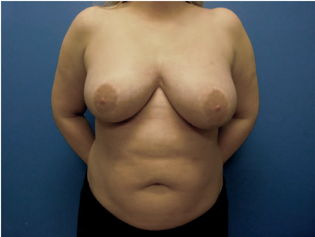
Fig. 4. 3-Month postoperative photograph.

excess skin envelope. Keeping this principle in mind, regarding our patient, we merely redraped the envelope and did not resect it.