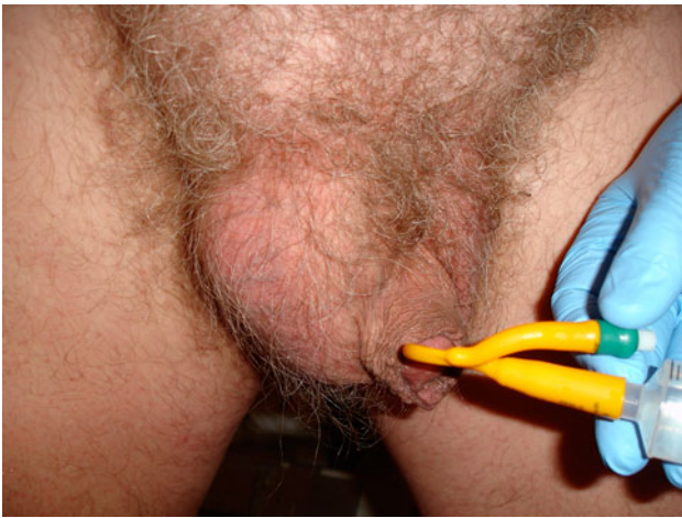
Fig. 1 Unilateral scrotal swelling after filling the bladder with saline