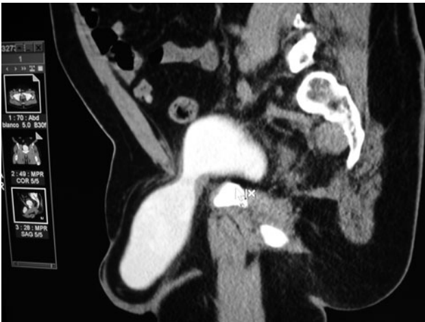
Fig. 2 Saggital computed tomography (CT) image with contrast in the bladder demonstrates bladder herniation