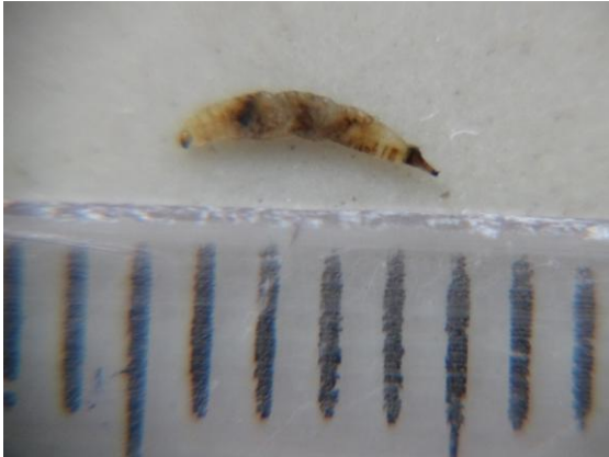
Fig. 1: Psychoda larvae collected from patients' urogenital tract

flies were seen. The place was also humid. At first, blood and urine tests were taken. Reports showed that everything was normal. However, in the patient's urine test, alive and active larvae were seen. According to the patient, six larvae have got out of her body in 2 days. The