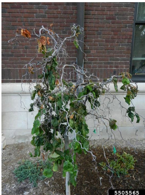
Figure 3: Symptoms of Anisogramma anomala on ornamental Corylus avellana .