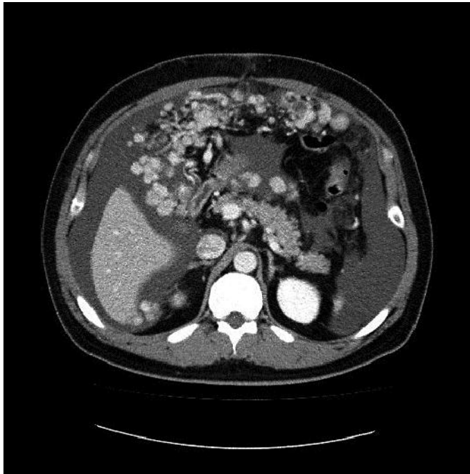
Fig. 1. A CT scan of the abdomen shows multiple nodules in the omentum, with a large amount of ascites.