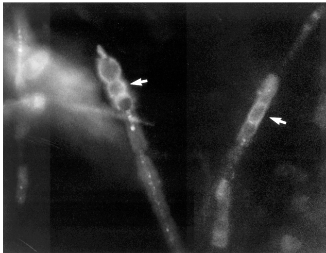
Figure 1. Coccidioides immitis hyphae dislodged from the tip of the ventriculo-peritoneal catheter tip, fixed in formalin and stained with Calcofluor. Stained barrel-shaped arthroconidia (arrows) are seen, along with empty cells (x400).

with a MIC \leq 8 \mu\text{g/mL} are considered fluconazole sensitive. Material from the tip of the shunt tubing was stained with Molecular Probes SYTOX Green nucleic acid stain (Part #: S-7020, Molecular Probes, Eugene, OR), which is an impermeable, high-affinity, dead-cell stain. After brief incubation with SYTOX Green stain, the nucleic acids of dead cells fluoresce bright green when excited with the 488-nm spectral line of the argon-ion laser. The stain was prepared at 0.1% (v/v) in autoclaved double-filtered nanopure water. The material was directly stained with 0.4 mL of SYTOX Green and allowed to react for 5 minutes. Next, the sample was mildly washed with autoclaved nanopure water to remove excess stain and minimize background fluorescence. This material was directly imaged on a confocal laser scanning microscope (CLSM). The sample was then sectioned at each centimeter from the distal portion to the proximal portion. Monoclonal antibodies against C. immitis were not available for staining.