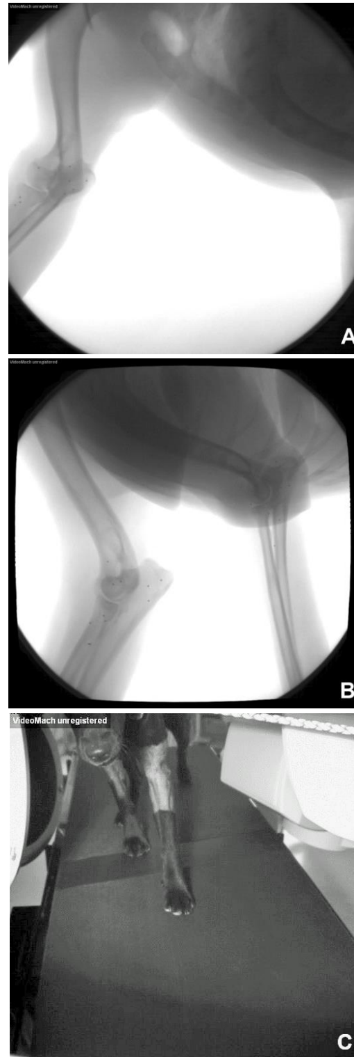
Fig. 1. Corresponding image set of synchronized bi-planar fluoroscopic high-speed video sequences (A, B) and live image camera just at the beginning of stance phase (C) for the left front limb. Implanted tantalum beads are clearly visible. All cameras operated at a frame rate of 500/sec, 0.5 ms shutter and a resolution of 1024 x 1024 pixels.

Within Maya, a Cartesian 3D joint coordinate system was defined (Fig. 3) with the z-axis orientated along the caudal border of the proximal ulna, the x-axis perpendicular to the z-axis and through the tip of the anconeal process and the y-axis perpendicular to the first two. Dynamic RUI was defined as any radial motion along the z-axis in relation to the ulna. Measurement of dynamic RUI started at frame 30, marking ground contact, and stopped at frame 150.