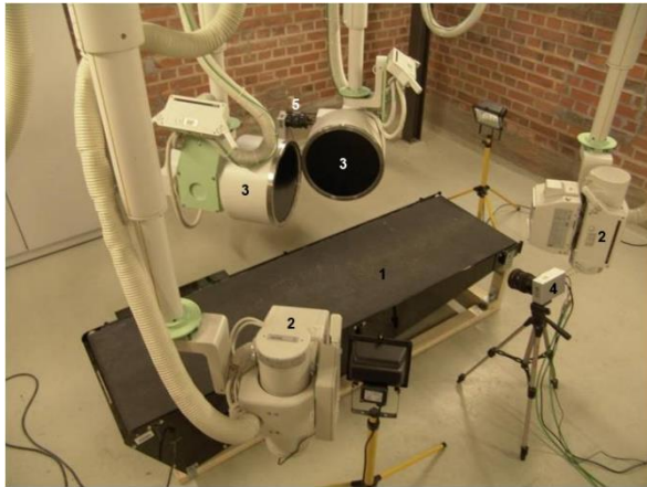
Fig. 2. Setup for high-speed bi-planar fluoroscopic kinematography. (1): treadmill; (2): x-ray tube assembly; (3): image intensifier; (4): digital high-speed video camera for live image capturing; (5): digital high-speed video cameras coupled to the image intensifier. The inter-beam angle is \sim 60^\circ and the x-ray source-to-image intensifier distance 1.4 m.