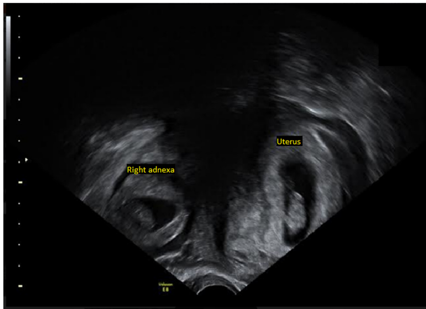
Fig. 1. Confirmation of heterotopic pregnancy on vaginal ultrasound. An intra-uterine and right adnexal gestational sac with a live embryo can be seen.