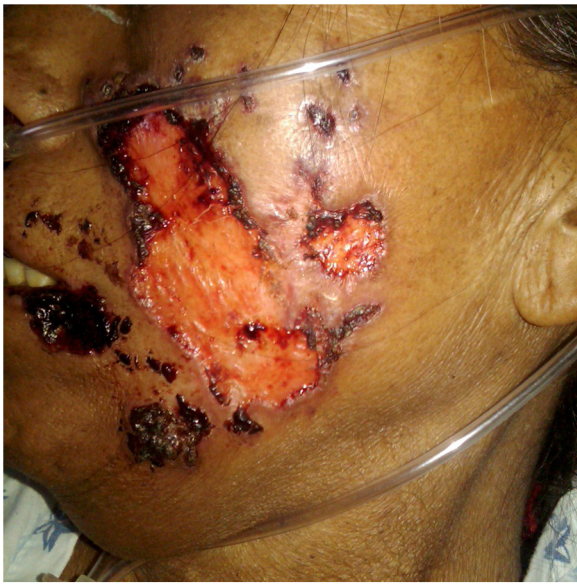
Figure 1 Large, necrotic face ulcers affecting the cheek and the oral mucosa.

tomography exhibited basal, bilateral consolidations and atelectasis, hepatomegaly, and free intraperitoneal fluid. Face ulcer smear and histopathology reported budding yeast cells and blastoconidia (Fig. 2). Despite receiving liposomal amphotericin B, the patient presented lesions dissemination to the oral cavity, lower gastrointestinal bleeding, mixed shock, and died fifteen days after admission. Face