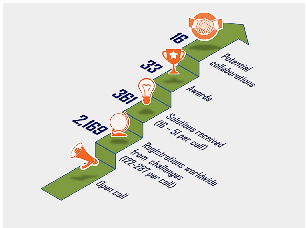
Fig 2. Attrition numbers for InnoCentive challenges from solver registration to potential collaboration. Boehringer Ingelheim has instigated 12 open crowdsourcing calls with InnoCentive that cover a wide range of topics, ranging from studying new translational models of psychiatric disease, to new approaches for the in vivo modulation of gene expression in lymphocytes, and to mimicking smooth muscle remodelling in severe asthma. A total of 2,169 solvers have registered themselves at the InnoCentive website in response to these calls and have provided more than 361 solutions, of which 33 have won awards, and 16 potential collaborations have been identified (status as of 12 December 2016).