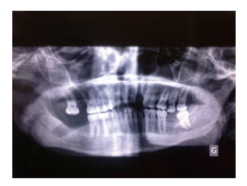
FIGURE 1: Preoperative panoramic radiograph.

abscess. Given this information, the infectious diseases service was consulted to determine the most appropriate antibiotic treatment to begin. With that service's recommendation, the patient was started on metronidazole 500 mg intravenously every 8 hours, vancomycin 500 mg IV every 6 hours, and cefotaxime 2 g IV every 4 hours.