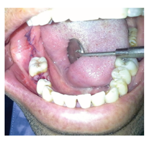
FIGURE 2: Intraoperative view after extraction of the mandibular right second premolar and debridement of the mandibular right third molar socket.

The patient, still under antibiotic treatment (metronidazole, vancomycin, and cefotaxime), exhibiting a slight improvement in walking and presenting no sign of headache nor vomiting, was permitted to be discharged on the ninth postoperative day and to continue the dental care, although it was not ended yet as mentioned in the treatment plan, by his general practitioner. Four days later, he was readmitted to the neurosurgery service owing to the new onset of walking disorders and severe headaches. Moreover, the patient complained of right arm and leg weakness. A new cerebral scan was ordered and it showed recurrence of the cerebellar abscesses that compressed the brain stem and the fourth ventricle with a sign of an active biventricular hydrocephalus (Figures 3(a) and 3(b)).