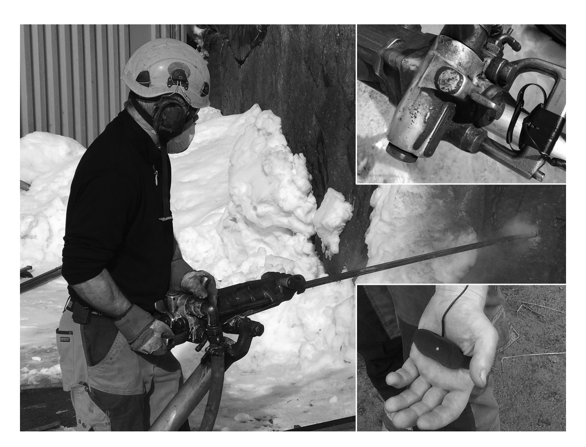
Figure 1. Work process (jackleg drilling) done for simultaneous measurements with tool-attached (upper right in picture) and hand-attached (lower right) accelerometers.

The mean, range, and standard deviation of the exposure variable (m s<sup>-2</sup>) for each worker for both accelerometer placements were calculated. A visual inspection and