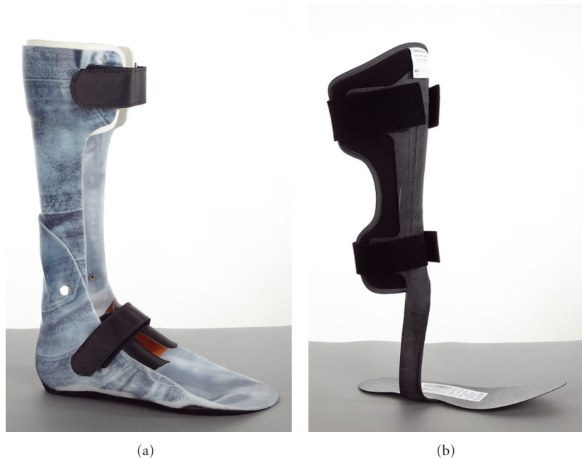
FIGURE 1: (a) Individually designed hinged ankle foot orthoses (DAFO), (b) Carbon composite ankle foot orthoses (C-AFO).

b Modified Ashworth Scale, calf muscle, 0–5.