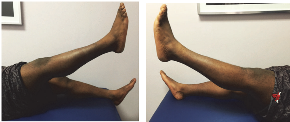
FIGURE 2: Clinical photos showing full active extension 2 years postoperatively without extension lag.

it difficult to perform an appropriate extensor mechanism examination [18]. Failure to diagnose the injury from the initial presentation can delay the appropriate treatment and lead to a suboptimal clinical outcome [5, 27, 34]. To diagnose a quadriceps tendon rupture (QTR), the treating physician must obtain a thorough history and physical examination and supplement it with the appropriate imaging if required. Mechanism of the injury, predisposing medical conditions, and steroid use are key elements of the history. In the physical examination, the presence of knee pain, effusion, palpable suprapatellar gap, and extensor mechanism insufficiency can lead to the diagnosis [22, 26, 27]. Intact extensor mechanism can be misleading at times; this can happen in cases of QTR with intact medial and lateral retinacula; in these cases, further workup is required [35].