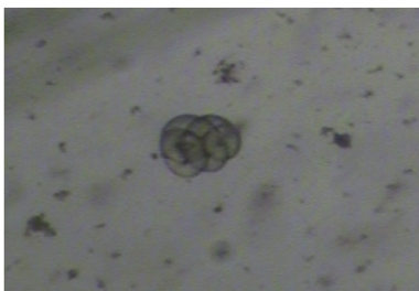
Fig. 1. Larva digested from beaver muscle tissue morphologically identified as Trichinella spp. (magnification 120x), Trichotele VKC 1310.

One of 69 examined beavers was found to be infected with T. spiralis (1,4%). The Regional Veterinary Laboratory in Krosno (Subcarpathian voivodeship) provided a positive sample. The density of invasion was 0.02 larva per gram (lpg). Based on the morphological characteristic larva was recognized as belonging to genus Trichinella (Fig. 1). The parasite was identified by mPCR as T. spiralis (Fig. 2). Forward and reverse sequences were aligned with Geneious R7 and checked using the freeware computer programs ClustalW and Mega 5. Results of alignments of amplified 5S rDNA sequences from the sample