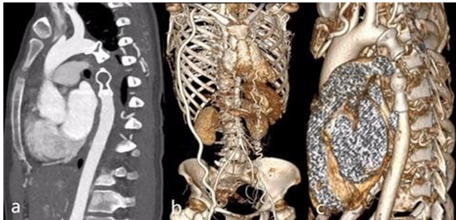
Fig. 3 1-year follow-up CT angiography. a. Multiplanar reconstruction imaging (MPR) demonstrated obliteration of the coarcted segment and distal pseudoaneurysm. b. Three-dimensional imaging showed a patent right axillary-to-femoral bypass graft. c. A 3-dimensional image showed the satisfactory position and shape of the occluders

hypertension, congestive heart failure, stroke, aortic dissection, and sudden death [9, 10].