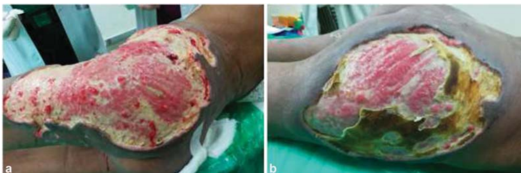
Fig. 2 Post debridement in phases reveals necrosis of the subcutaneous tissues, sparing the underlying muscles—(a) left gluteal region and (b) right gluteal region.

As extensive necrosis had already set in, the treatment focused mainly on local wound care and supportive medical management. The patient underwent extensive debridement of the necrotic tissues in consecutive sittings to reveal the subcutaneous tissues' necrosis sparing the underlying muscles (►Fig. 2). The granulation tissue filled up the defect after serial debridement and dressing of the affected site for nearly 6 weeks (►Fig. 3). We managed to cover the residual raw areas with healthy granulation tissues with split-thickness skin grafts with successful take-up.