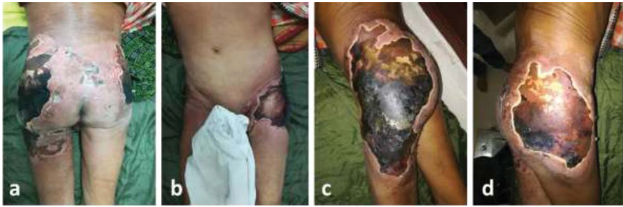
Fig. 1 Extensive areas of necrosis covered with black eschar present over the bilateral gluteal region—(a) bilateral buttock affected; (b) the lesion extending anteriorly on left side; (c) close view of left gluteal area showing necrosis, with desquamated areas and surrounding skin erythematous; and (d) close view of right gluteal area.

blisters, which ruptured and finally turned black. Over 4 to 5 days, it spread to the opposite buttock, the upper thighs, lower back, and the groin, giving it an odd appearance. The pain had subsided over time with resulting extensive gangrenous patches of skin. He had no complaints of fever or other signs of systemic infection. The person never had a similar experience previously despite having received IM diclofenac for various causes. He had no known history of any drug reactions or allergies in the past. He was a known smoker and ganja addict, consumed alcohol, and was without any known medical comorbidities.