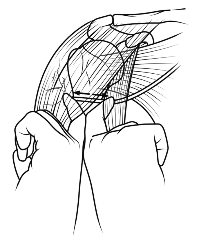
Figure 1 Tug test ( \rightarrow ). The index finger is directed posteriorly in the subdeltoid space while the other index finger is placed medially into the subcoracoid space and over the axillary nerve. A gentle tug on the nerve with the subdeltoid index finger can be transmitted across the nerve and felt with the other index finger, confirming that the nerve has been correctly identified. (Reproduced with permission from Chalmers PN, Van Thiel GS, Trenhaile SW. Surgical exposures of the shoulder. J Am Acad Orthop Surg 2016;24:250-8.)

capsule peel off to draw the lesser tuberosity away from the axillary nerve,<sup>29</sup> care was taken not to leave the arm in the extended, adducted, and externally rotated position for prolonged periods. Retractors were then placed circumferentially around the humeral head, with one placed inferiorly to protect the axillary nerve and one placed medially to protect the glenoid and brachial plexus. After the humeral head was removed, the glenoid was exposed. The labrum was resected circumferentially by releasing it from its capsular attachments. The capsule was released from the glenoid rim by use of electrocautery with care taken to stay directly on bone. We did not perform a 360° subscapularis release in any case.<sup>22,25</sup> The described exposure allowed direct access to the glenoid without palpating or exposing the axillary nerve or using the tug test. Video 1 shows performance of this technique.