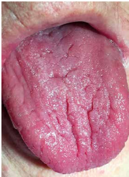
Figure 2. Fissured tongue in patient with psoriasis