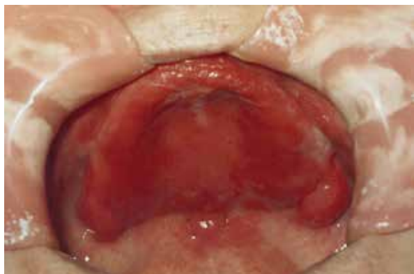
Figure 3. Type 2 DS, diffuse hyperaemic mucosa extending over the entire denture-bearing area in an acrylic complete denture wearer with psoriasis