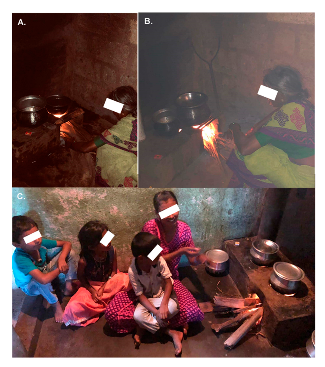
Figure 1. Representative pictures from field studies in Mysuru, Karnataka, India showing biomass smoke exposure among women and children during cooking. ( A ) At the start of cooking when the air is relatively cleaner. ( B ) 15 min after the start of cooking and this remains for at least 1 h after cooking. Usual cooking time is about 1–1.5 h. ( C ) Children along with mother are exposed to biomass smoke during cooking.