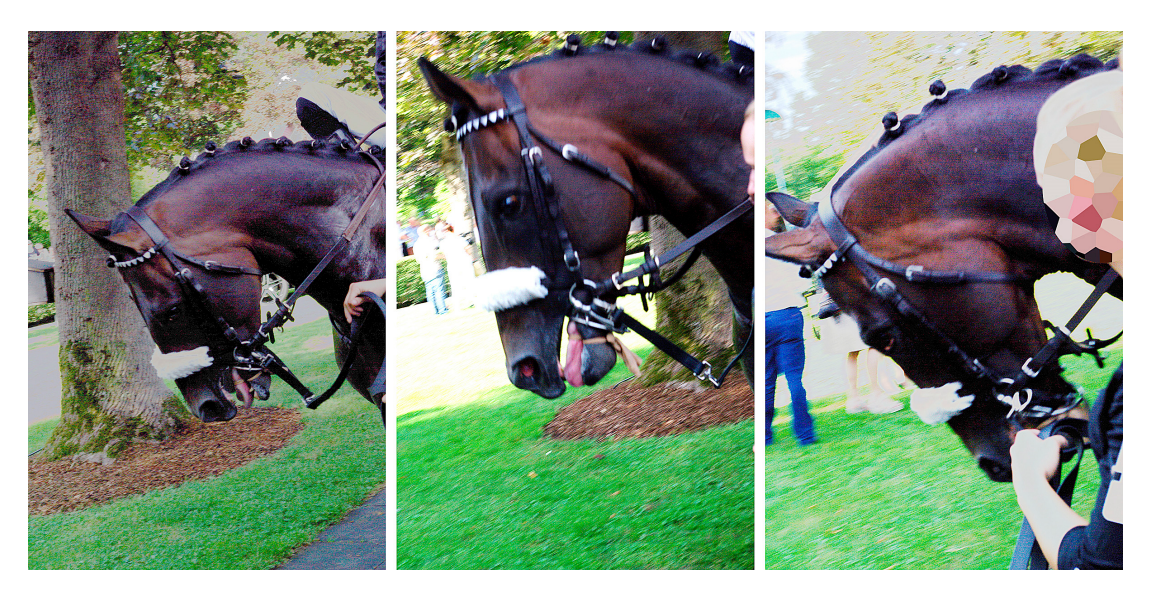
Figure A2. Images 4–6 of eight images of a thoroughbred with a tongue-tie taken on race day while the horse was led past the photographer/researcher in the mounting yard.