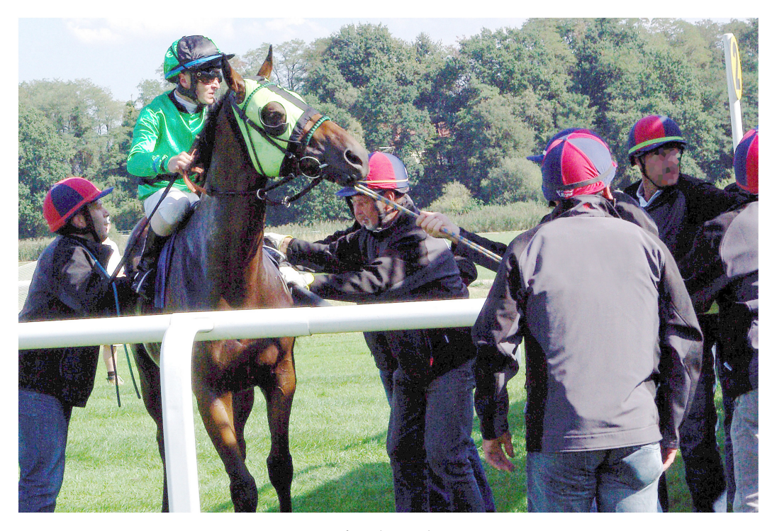
Figure 3. Image 3 for photo-elicitation interview.

Image 3 (Figure 3) shows a thoroughbred almost in full, with a jockey on his back, with six handlers close by, some touching the horse and some holding ropes attached to the horse. Handlers and horses show intent.