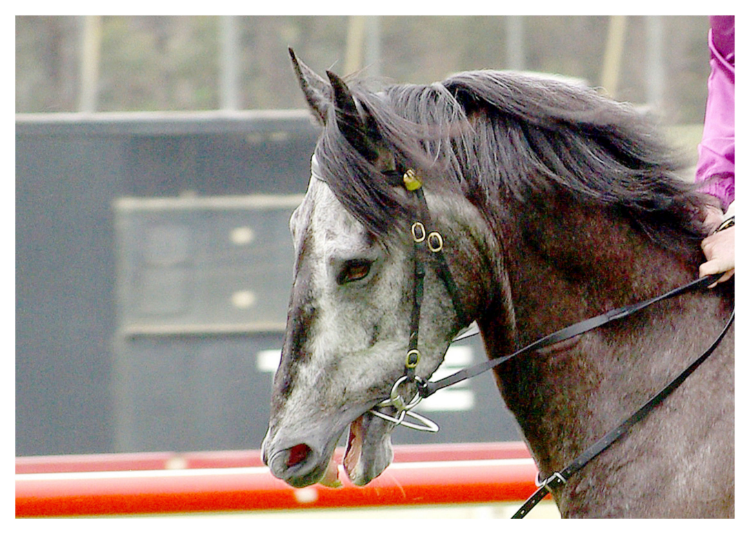
Figure 2. Image 2 for photo-elicitation interview.

Image 2 (Figure 2) shows a moving thoroughbred's head close up, as well as part of the jockey's hand and arm. The jockey holds close contact with the reins, and the horse's mouth is open.