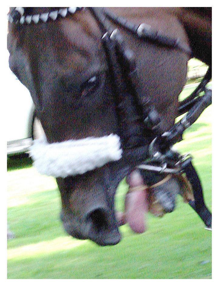
Figure 4. Image 4 for photo-elicitation interview.

Image 4 (Figure 4) shows a head of a thoroughbred close up, bridled and on a lead rope, head lowered, mouth opened and tongue and tongue-tie visible.