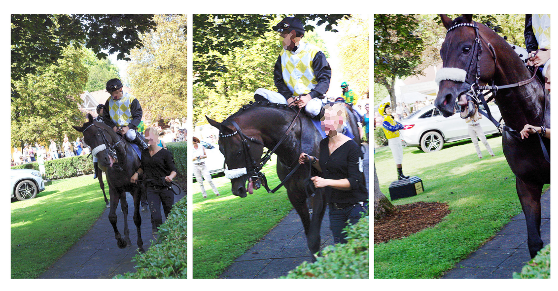
Figure A1. Images 1–3 of eight images of a thoroughbred with a tongue-tie taken on race day while the horse was led past the photographer/researcher in the mounting yard.