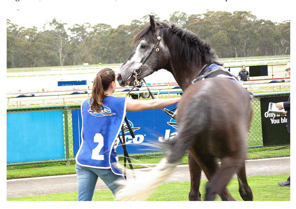
Figure 1. Image 1 for photo-elicitation interview.

Image 1 (Figure 1) shows a full-body view of a saddled thoroughbred led by a handler. The thoroughbred, as well as the handler, show a distinct behavioural response.