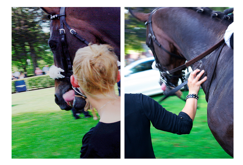
Figure A3. Images 7 and 8 of eight images of a thoroughbred with a tongue-tie taken on race day while the horse was led past the photographer/researcher in the mounting yard.