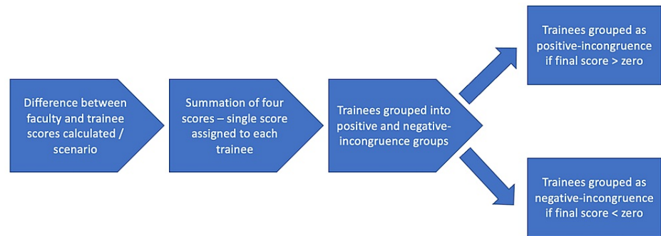
FIGURE 1: Assigning postgraduate medical trainees into positive-incongruence and negative-incongruence groups