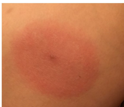
Figure 1 Skin erythema migrans seen in the present patient (The photo was kindly provided by the patient).

Lyme disease is a multisystemic disorder caused by infection with spirochete species including B. burgdorferi . 1 The vectors of human borreliosis are ticks ( Ixodes species), and Ixodes persulcatus is a transmission vector in Japan. 3 On the other hand, the reported number of Lyme disease cases is less than 20 per year. Therefore, Lyme disease is not generally considered a common cause of fever of unknown origin (FUO) in Japan, although it is very common in North America and Europe. However, some sporadic and transported cases have been reported in mainland Japan. Thus, Japanese ID physicians should consider this disease as one of the possible causes of FUO and carefully ask patients about their living conditions and past histories. 4,5