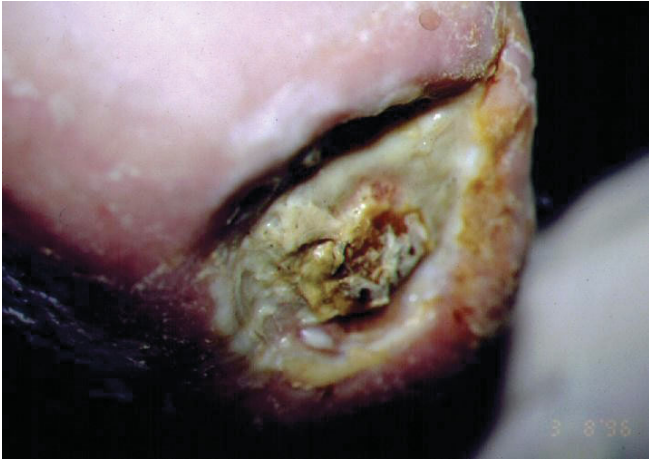
Figure 1. Wound before maggot debridement therapy. This wound, covered with a thick layer of slough, failed to respond to conventional treatment over 18 months.

microbials in order to cleanse the wound effectively. The application of maggots to an infected wound results in the rapid elimination of such infecting microorganisms (2,6,40,41). The most frequently isolated pathogen from acute and chronic wounds is Staphylococcus aureus . S. aureus is carried innocuously by ~30% of the general population (42) [40–70% of hospital staff (43,44)], usually on the moist skin in the nose, axillae (armpits) and perineum (groin), but can become pathogenic when able to enter damaged skin. S. aureus has caused great concern owing to its ability to acquire resistance to a range of antimicrobials.