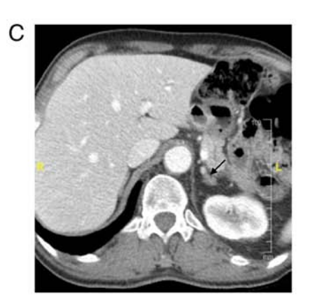
Figure 2. Imaging findings in a 62-year-old male patient with metastatic non-small cell lung cancer who was treated with second-line nivolumab and developed oligometastatic disease progression. Axial contrast-enhanced CT scan of the abdomen demonstrating a left adrenal gland metastasis (black arrows) at (A) baseline; (B) 6 months post-nivolumab therapy demonstrating disease progression; and (C) 8 weeks post-stereotactic body radiotherapy (40 Gy in 4 fractions) showing a significant reduction in the size of the left adrenal gland metastasis.

The optimal strategy for integrate RT into the immune treatment pathway still remains to be determined. Several questions regarding optimal RT dose and fractionation, treatment technique, timing and safety still remain unanswered. A plethora of clinical trials are currently investigating these RT-immune interactions (Tables I and II), however, several challenges remain to be addressed to maximize the efficacy of this promising combination.