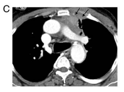
Figure 1. Imaging findings in a 62-year-old male patient with metastatic non-small cell lung cancer who was treated with second-line nivolumab and developed oligometastatic disease progression. Axial contrast-enhanced CT scan of the chest showing a left lung primary tumour (black arrows) at (A) baseline; (B) 8 weeks post-nivolumab therapy demonstrating disease progression; and (C) 8-weeks post-radiotherapy (20 Gy in 5 fractions) showing treatment response.