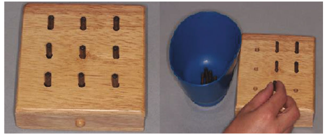
FIGURE 1: The 9-HPT kit and its application.

The 9-Hole Peg Test (9-HPT) is a brief, simple, standardized, timed measure test to evaluate upper extremity function and skills. 9-HPT material comprises a shallow dish next to the 9-hole pegboard with nine wooden/plastic pegs (Baseline Evaluation Instruments, USA, Lot: 055965) (Figure 1). The pegboard is placed before the subject at the midline, with the container holding the pegs oriented towards the participant's hand being tested. The subjects are seated on a height-appropriate chair to ensure that the tabletop is at midchest level. The test task requires the subject to take the pegs from a container one by one and place them