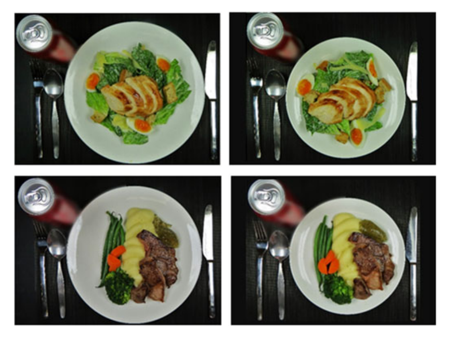
Figure 1 Examples of photographs of the same dish on the large plate (A; 27-cm diameter) and the small plate (B; 23-cm diameter). Aside from the plates, sizes of other components are constant. Respondents were specifically instructed not to consider the can of drink in their responses.

condition (Canon SX50 HS, 180 dpi). All photos included cutlery (a knife and fork set or a pair of chopsticks depending on the ethnic origin of the dish), and a standard 355-ml drink can serve as visual references of the size of the dish (see examples in Figure 1). For each photograph, the food area on the plate was measured three times by image measurement software (Klonk, Image Measurement Corporation, USA), the average of which was recorded for computing the Food/Plate ratio. Consistently across all dishes, the small plates are associated with higher Food/Plate ratios than the large plates. Details about the dishes and photographs are in Table 1.