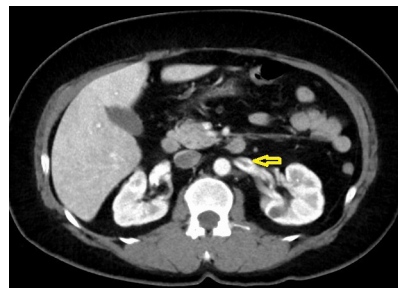
Figure 2 Axial view of thrombosis in the left gonadal vein with extension to the left renal vein.

The COVID-19 pandemic caused by the SARS-CoV-2 has affected millions of people worldwide. While a majority of the people affected by the virus remain asymptomatic, most patients admitted to the hospital present with severe respiratory illness. The most extensive published case series from China and New