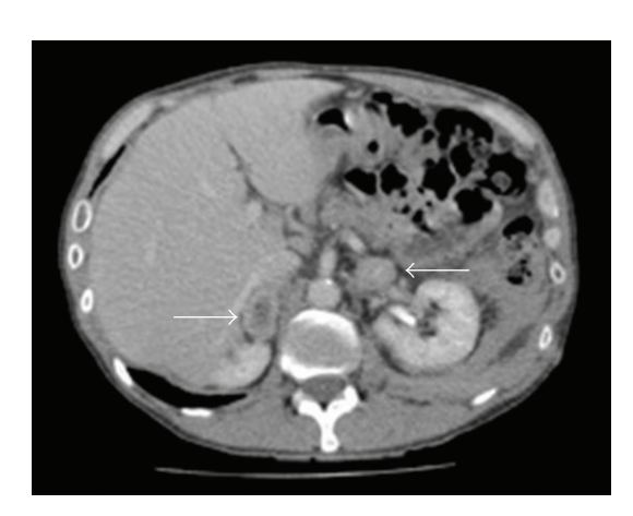
FIGURE 3: Axial CT image at the level of the adrenal glands demonstrating bilateral adrenal masses (arrows).

dopamine 3999 nmol/24 hrs (normal range 0–2700 nmol/24 hrs), metadrenaline 5719 nmol/24 hrs (0–1000 nmol/24 hrs), normetadrenaline 8105 nmol/24 hrs (0–3000 nmol/24 hrs), 3-methoxytyramine 1664 nmol/24 hrs (normal range 0–2300 nmol/24 hrs). These results and the findings of the CT scan were discussed with the hospital's biochemistry laboratory; they advised that although bilateral phaeochromocytomas would be rare, in light of this patient's high clinical probability, repeat 24-hour urine collection analysis plus a chromogranin A test should be performed. The levels of three separate chromogranin A assays were mildly raised: 6.9 nmol/L, 6.4 nmol/L, and 6.2 nmol/L (normal range 0–6 nmol/L). Once again, all urinary catecholamines and metanephrines other than 3-methoxytyramine were significantly raised: adrenaline 522 nmol/24 hrs, noradrenaline