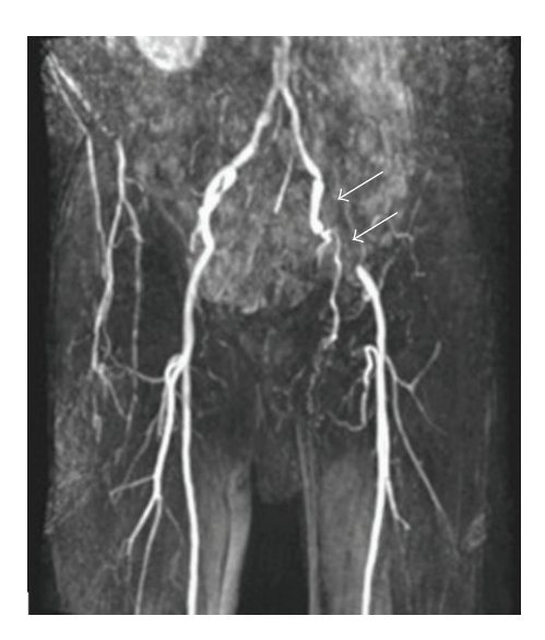
FIGURE 1: MIP (Maximum Intensity Projection) image from Magnetic Resonance Angiography (MRA) examination demonstrating occlusion of the left external iliac artery (arrows). The left common iliac artery, internal iliac artery, and common femoral artery remain patent.

Percutaneous access was obtained using ultrasound guidance at the right groin, and pump aortic angiography was performed using a pigtail catheter, confirming the MRA findings. A 7F destination sheath was placed from the right side across the aortic bifurcation, and a 0.018" wire was placed within the internal iliac system in order to protect it during the subsequent procedure. The left external iliac artery occlusion was then successfully crossed antegradely using a 4 French Cobra catheter and hydrophilic wire, although this proved difficult due to the firm nature of the occlusion. Predilatation was performed with 3 mm and 5 mm balloons, with no evidence of rupture on subsequent angiography, before placement of a 8 mm × 60 mm self-expanding bare metal stent (ev3 Inc, MN, USA). Postdilatation was performed with a 7 mm balloon.