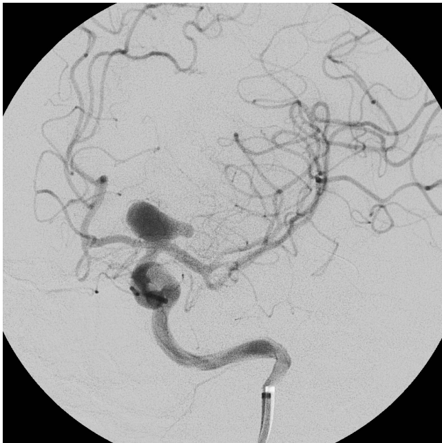
Figure 1. Cerebral angiography demonstrated a wide necked aneurysm at the termination of the ICA.

A 56 year old, right handed male was listed for coiling of an unruptured intracranial aneurysm. The aneurysm was discovered as an incidental finding on a CT scan of the head performed for the investigation of a previous episode of confusion. Cerebral angiography demonstrated an approximately 12mm wide necked aneurysm at the termination of the intracranial segment of the left internal carotid artery (ICA) (Figure 1). The patient's past medical history included hypertension and heavy smoking and he had a BMI of 32.