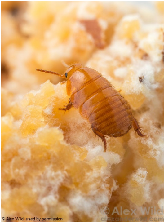
FIGURE 1 An adult female Attaphila fungicola roach on part of an established leaf-cutter fungal garden

colonies) (Moser, 1964; Phillips, 2021). Reciprocally, if roaches rarely or never use routes of vertical transmission that pass through incipient colonies, selection on roaches to avoid overexploiting and damaging incipient gardens should be weak ( weak incipient garden compatibility ). Alternatively, if roaches rely heavily on vertical transmission for dispersing between nests, they should be under strong selection to successfully co-establish with incipient colonies, and to minimize harm and possibly provide benefits to incipient gardens ( strong incipient garden compatibility ) (Combes, 2001; Genkai-Kato & Yamamura, 1999; Iritani et al., 2019; Lipsitch et al., 1996). To test whether roaches exhibit strong or weak incipient garden compatibility, and whether roaches primarily use vertical or horizontal transmission, we use a laboratory experiment to estimate the effect individual roaches have on the survivorship of low-volume fungal gardens in artificial foundress chambers, and we use field surveys and a between-colony transmission model to estimate the contribution of vertical transmission to roach prevalence among mature leaf-cutter colonies.