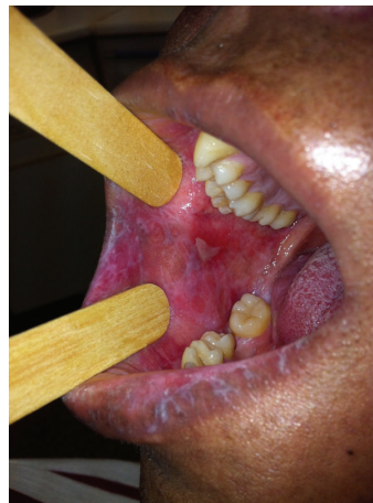
FIGURE 2: Chronic mucosal GvHD characterized by lichenoid inflammation and pseudomembranous mucositis.

3.3. Oral Mucosal cGvHD. Chronic mucosal GvHD of the oropharynx is estimated to occur in 45–83% of patients [76, 84] and is characterized by lichenoid inflammation particularly affecting the tongue, buccal mucosa, and the lips [85] (Figure 2). Clinical signs resemble those seen in lichen planus and include white hyperkeratotic reticulations and plaques, erythema, and ulcerations, which may be covered with a pseudomembrane. In addition, the gingiva may become atrophic. Early clinical recognition and treatment of GvHD prevent progression into more significant morphological changes [79]. Typical histopathological features include apoptotic bodies, satellite necrosis and lichenoid interface inflammation, and lymphocytic infiltration at the junction of the epithelium and subepithelial connective tissue [74, 79]. Additionally, an inflammatory infiltrate caused by superimposed infection may be present. It is important to be aware of other complications that can mimic oral cGvHD, including oral mucosal reactions to medications (including mammalian target of rapamycin (mTOR) inhibitors), local allergic reactions, infections, and second primary tumors.