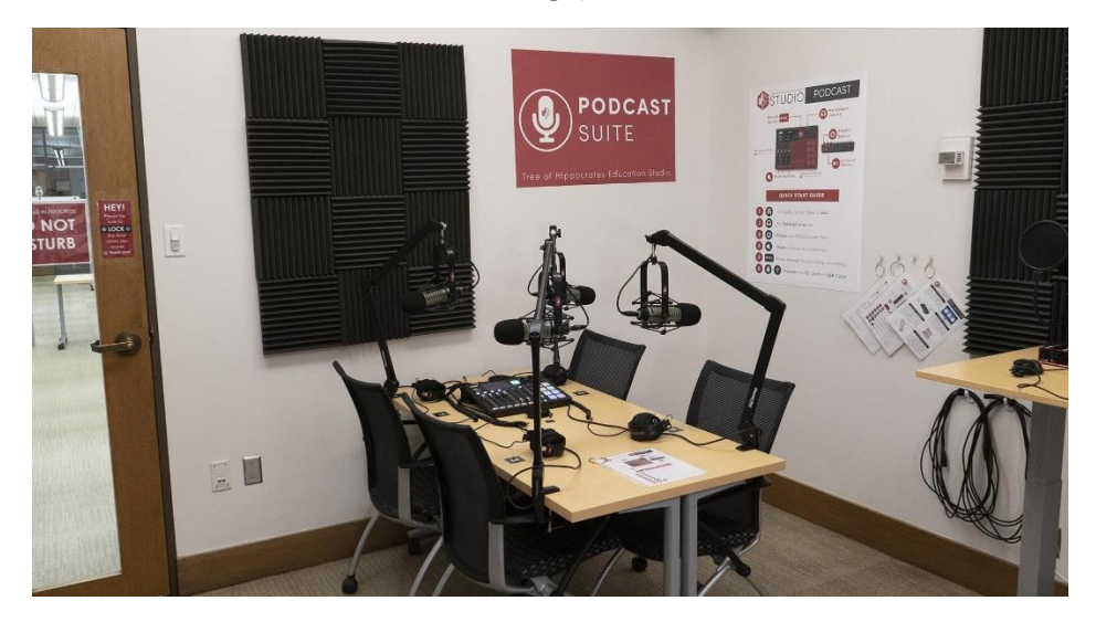
Figure 2 The Podcast Suite inside THE Studio, a multimedia recording space

To familiarize visitors with the equipment in the Podcast Suite, staff created an <u>instructional guide</u> for users. The guide includes: