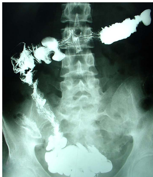
Figure 3 Small bowel series (small bowel transit) shows narrowing and irregularity of the terminal ileum and ulceration in its wall, highly suspicious for tuberculosis.