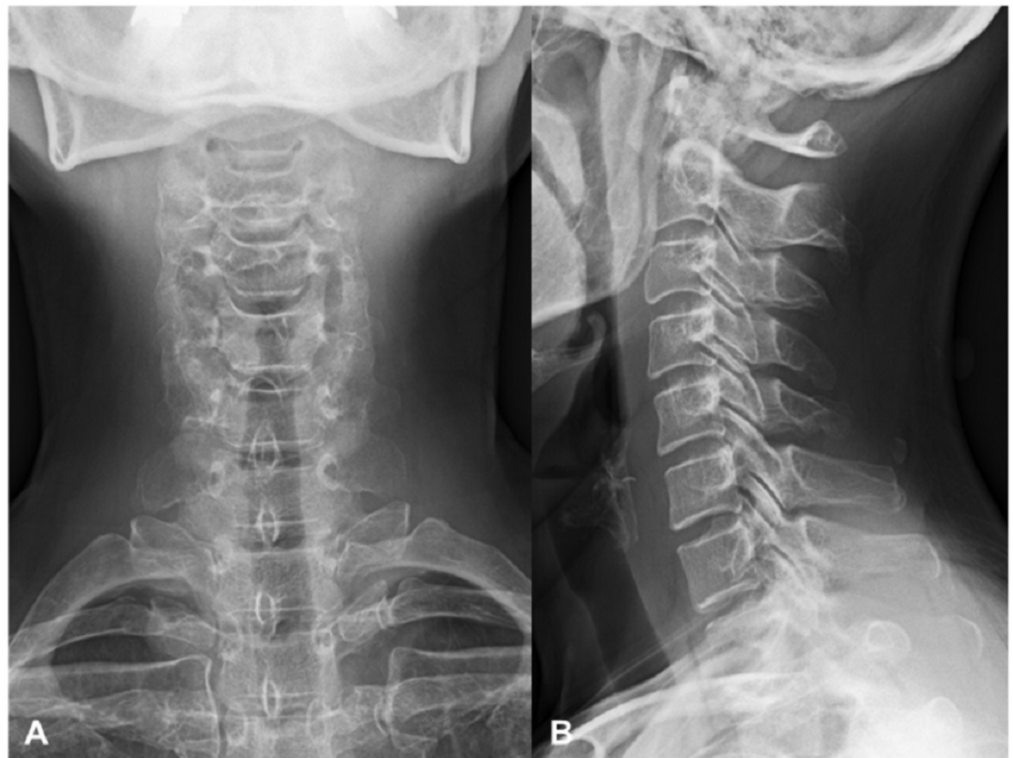
FIGURE 1: Plain radiographs of the cervical spine on initial presentation

Laboratory data showed a slight elevation of C-reactive protein (0.29), an erythrocyte sedimentation rate of 16 mm/h, and a normal white blood cell count (4100/ul). Other laboratory findings were within normal limits. Plain radiographs of the cervical spine showed no apparent abnormality (Figure 1). Owing to suspicion of emergent diseases, such as a retropharyngeal abscess, CT of the neck was performed. It revealed massive retropharyngeal calcification with its longest diameter (18 mm) in front of the C1-C2 vertebrae (Figure 2). It was inhomogeneous and irregularly shaped with associated soft tissue swelling. Magnetic resonance imaging (MRI) showed markedly increased signal intensity on T2-weighted images and intermediate signal intensity on T1-weighted images at the anterior C1 to C5 level (Figure 3). There were no findings of spondylitis, epidural abscess, or tumor.