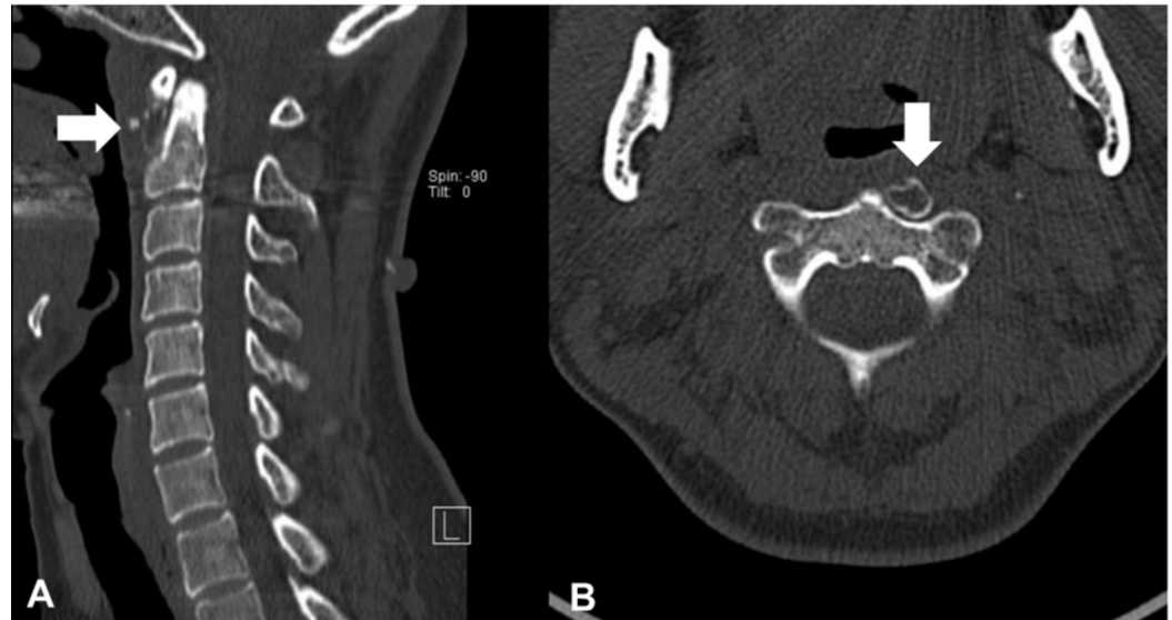
FIGURE 4: Computed tomography (CT) scans of the cervical spine at the one-month follow-up

Thus, the patient was diagnosed with acute calcific retropharyngeal tendinitis, and the condition was treated with a soft collar and non-steroidal anti-inflammatory drugs (NSAIDs). Two weeks later, the neck pain and dysphagia improved. At the one-month follow-up, she had a complete resolution of the symptoms. A follow-up CT showed residual marginal calcification, which was diminishing in size, suggesting an eggshell-like calcification (Figure 4).