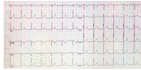
FIGURE 1: 12-Lead ECG from the patient.

Since most children and adolescents with SVT have sporadic brief episodes of arrhythmia, it may be difficult to capture an episode on ECG. Holter monitors allow continuous ECG recording for typical 24–48 hours and is therefore useful only in patients with frequent runs of SVT. Adhesive patch monitors allowing for longer heart rhythm monitoring may be an