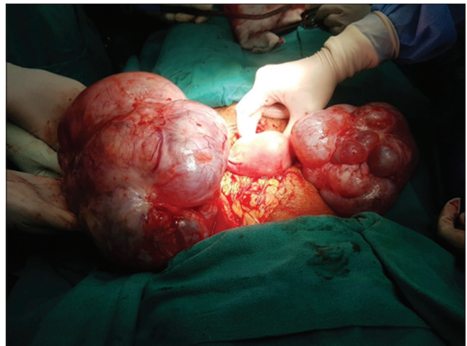
Figure 2: Bilateral ovarian masses with enlarged uterus due to multiple fibroids