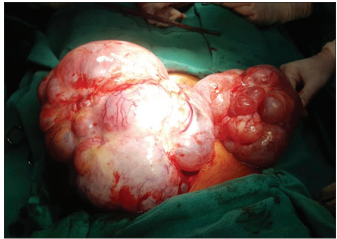
Figure 1: Bilateral ovarian masses with bosselated surface and increased surface vascularity

Her fluid cell cytology showed no malignant cells. Histopathology was suggestive of bilateral ovarian pure TCC as there was no evidence of any benign, borderline, or malignant Brenner component, neither was there any serous component identified [Figure 3a and b]. There was endometrial hyperplasia along with myometrial adenomyosis and leiomyomatosis in the uterus. Immunohistochemistry was done to confirm the diagnosis, and the tumor cells showed nuclear positivity for WT1, cytoplasmic positivity for CK-7 [Figure 3c and d], and membrane positivity for Ber-EP4.