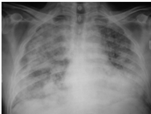
Fig. 1 Chest X-ray in PRS. Patchy opacities

There is no doubt that glucocorticoid therapy continues to be the battle horse for the treatment of vasculitis and in particular PRS vasculitis. Pulse dosing continues to give the best results, and the drug of choice is methylprednisolone 15–20 mg/day for three to five continuous days, followed by the maintenance dose of 1–2 mg/kg/dose (divided into three doses), with