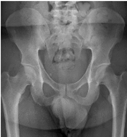
Image 1. A plain anteroposterior view of the patient's pelvis, not showing any foreign body.

AP and lateral radiographs were obtained of the pelvis, but no obvious foreign object or mass was clearly visualized (Image 1).