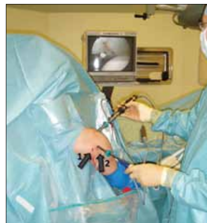
Figure 2: The posterior working portal (2) is more lateral to the standard posterior portal (1). It usually lies 2–3 cm directly below the posterolateral angle of the acromion

The labrum was mobilized and the posterior glenoid rim was prepared. Suture anchor repair was performed with suture anchors, using biodegradable anchors and high-strength sutures [Figure 4]. One to four (mean: 2.3) anchors were used in each case, depending on the size of the tear. An additional posterior capsular plication was added if the posterior capsule was felt to be particularly lax. This was determined by examination under anesthesia, visual inspection, and palpation. Only two patients required this and their outcome or recovery was no different from that of the other cases.