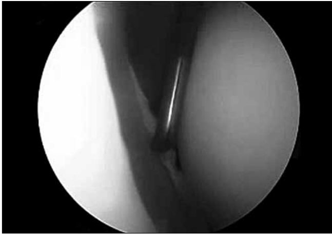
Figure 3: Probing of a posterior labral tear of the left shoulder, as seen from the anterior portal