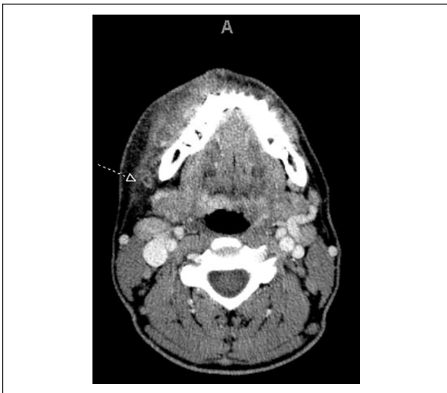
Figure 2. Contrast-enhanced computed tomography scan of neck showing right facial vein thrombosis (arrow) with surrounding inflammation.

suggestive of right pulmonary artery and left anterior segment pulmonary embolism.