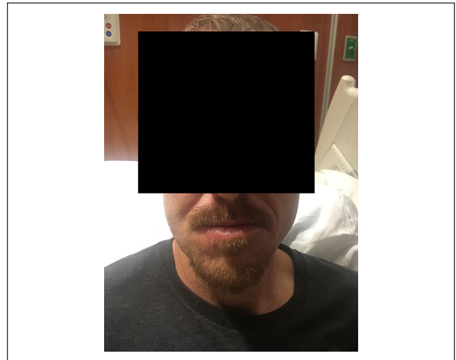
Figure 4. Patient after 10 days of treatment.

The patient responded well to treatment, and after 1 week, his submandibular edema subsided (Figure 4). He was discharged from the hospital after receiving 2 weeks of intravenous vancomycin and completed a 4-week course as an outpatient. This was administered via a peripherally inserted