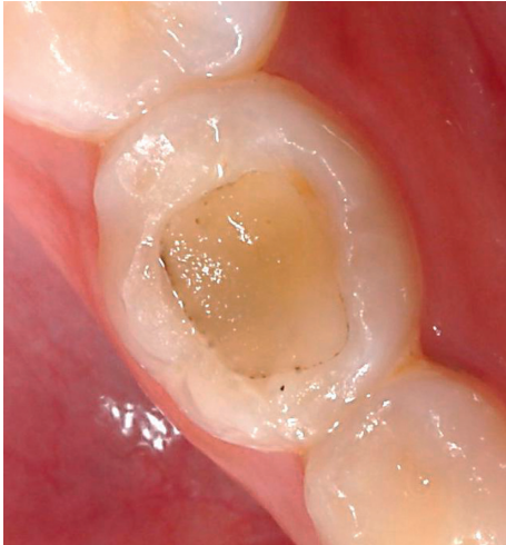
FIGURE 3: Clinical aspect at 18 months of follow-up.

Another advantage of the proposed treatment is the permanence of the primary teeth in the oral cavity until its natural exfoliation period [16], a fact that should be highlighted in the dental treatment of children. In this case report, the patient was seven and a half years old, which suggests that the primary molar will remain for at least 3-4 years in her mouth. With all this preexfoliation time, it has become imperative to perform a minimally invasive treatment that preserves the prognosis of dental longevity.