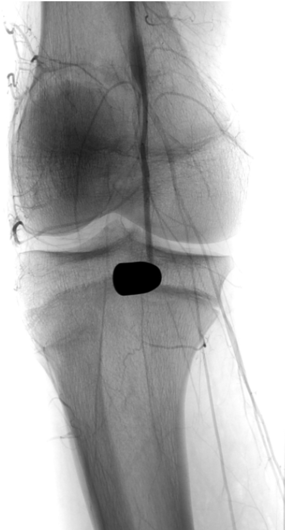
FIGURE 1: Right lower extremity angiography at the level of the knee with the patient's leg held in extension

There is a retained bullet fragment in the popliteal fossa and abrupt cessation of vascular