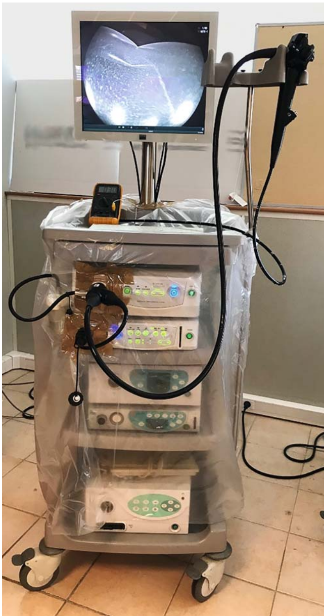
► Fig. 3 Endoscopic system with a plastic film around the light source and the processor box.

inadequate sealing. To counterbalance this effect, we exchanged the surgical mask for a plastic film around the endoscopic system to create a barrier around the aspiration and the ventilation airport (► Fig. 3 ). Of note, enough was left outside the endoscopic platform and inside the plastic to allow for air sufficient to regulate the temperature and make ventilators efficient enough to maintain a stable temperature. In such conditions, using a FUJIFILM light source system with a LED lamp, the temperature rose from 25°C to 29°C in 15 minutes and was stable for more than 2 hours. In the same conditions using a FUJIFILM light source system with a Xenon lamp, the temperature rose from 25°C to 41°C in 30 minutes. The experiment was stopped because a high temperature (>40°C) is associated with