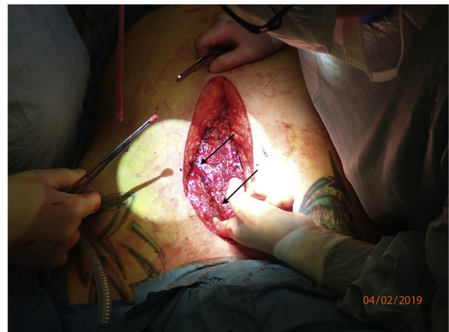
Fig. 3. Perioperative picture showing the fractures. The arrows are marking the fracture line.

After stabilization, the patient was admitted at the ICU. Three days after admission the tibia fracture was osteosynthesized. At day 6 the patient still needed mechanical ventilation, and a tracheostomy was performed. Due to difficult pain management and continued need for mechanical ventilation, it was decided to surgically stabilize the flail chest.