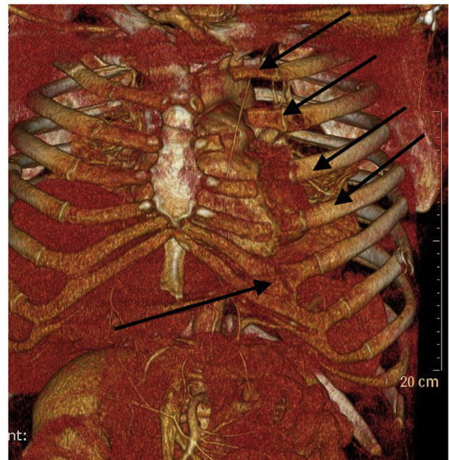
Fig. 2. The same trauma scan, but with a 3D reconstruction visualizing cartilage. The arrows are showing the cartilage fractures/dehiscence.

However, the severity of the trauma was not clearly visible in the first 3D bone reconstruction. A new reconstruction was performed with the same software as 3D bone reconstruction using VRT: Volume Rendering Technique. It has a setting that included softer Hounsfield Unit values than those for the bones, thereby clearly revealing the chest cartilage from the same trauma CT scan. After reconstructing the cartilage structure, the sternal dehiscence was perceptible, which is seen in Fig. 2.