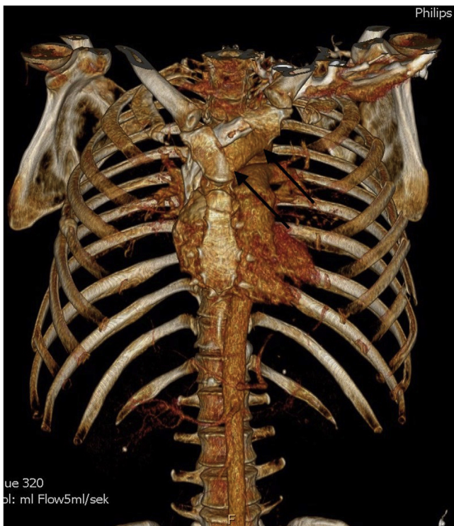
Fig. 1. 3D reconstruction of the trauma scan showing flail chest with the fracture line anteriorly and several lateral costal fractures on the left side. The arrows are marking the manubrium fracture.

reports [6,7] and only a few very small randomized, controlled trials exist [8]. Hitherto, the level of evidence is relatively low.