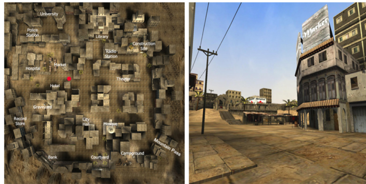
Fig. 2 The combination of survey and route display in Brunyé et al. (2012)

Jones, 1999; Stoakley, Conway, & Pausch, 1995). The WIM display, typically used in first-person video games, shows a smaller top-down view (i.e. a map with the updated position of the learner) somewhere within a full-screen route perspective display. Importantly, in both Brunyé et al. (2012) and the WIM studies, perspective switching was neither forced nor directly measured. Showing both perspectives simultaneously did not ensure switches between the perspectives. Thus, it remains unknown whether participants switched or not, and if they did switch, how often and when switching happened.