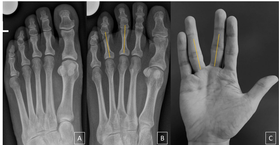
Fig. 1 A Negative Vulcan salute sign in a 50-year-old woman from the control group. B Positive Vulcan salute sign (V-sign) of the 3/4 interspace in a 46-year-old woman with Morton's neuroma. C "Vulcan salute" from one of the authors

For angle measurements, the interobserver agreement was evaluated by the intraclass correlation coefficient (ICC). The chi-squared test was used to compare the presence of the