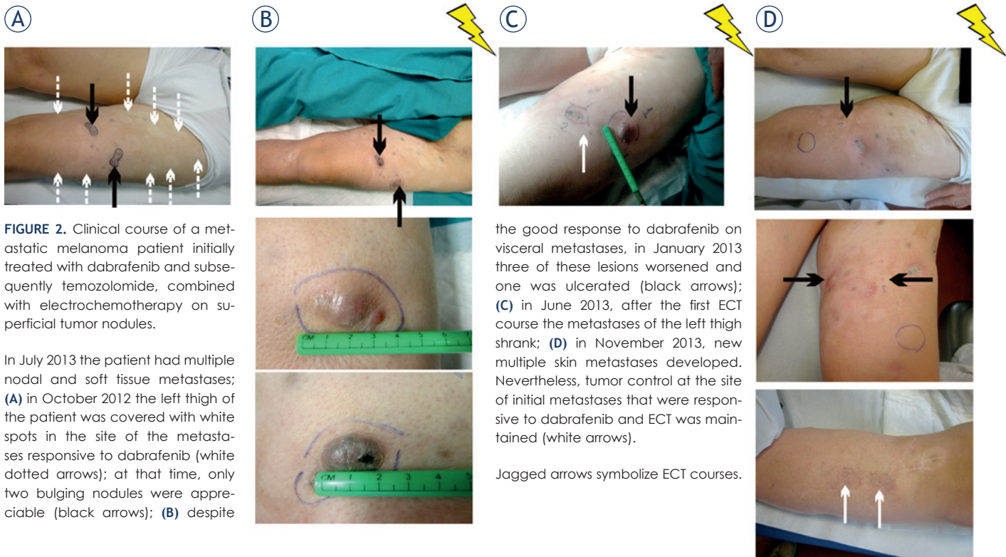
FIGURE 2. Clinical course of a metastatic melanoma patient initially treated with dabrafenib and subsequently temozolomide, combined with electrochemotherapy on superficial tumor nodules.

In July 2013 the patient had multiple nodal and soft tissue metastases; (A) in October 2012 the left thigh of the patient was covered with white spots in the site of the metastases responsive to dabrafenib (white dotted arrows); at that time, only two bulging nodules were appreciable (black arrows); (B) despite